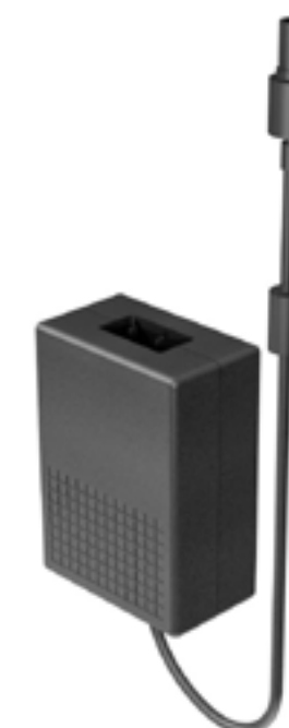
POWER SUPPLY C13/C14

Country-specific versions of the power-supply units required for E-LINE by DIRAK systems are available in the versions EU, UK and USA.