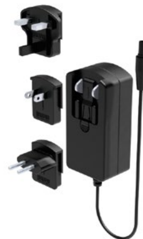
POWER SUPPLY UNITS (12/24V DC)

If the door contact is connected to the readers of the MLR3000 and MLR5000 systems, our MLM Suite will also show you the current status of the particular rack door.