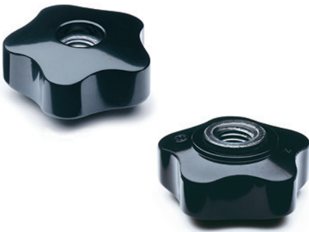
ELESA Original design

UNI 6960-71 type B with pass-through hole.