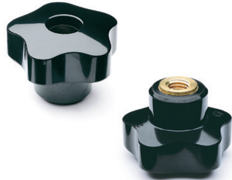
ELESA Original design